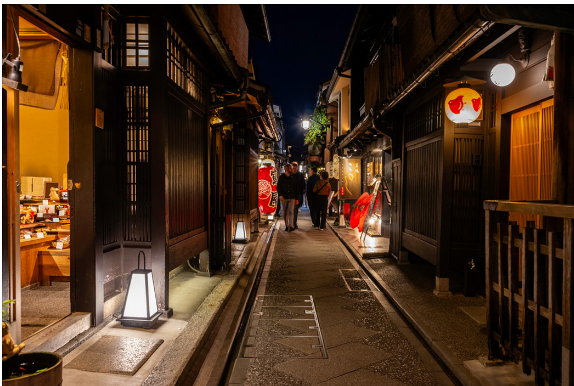
'Pontocho Alley, Kyoto' - Dass