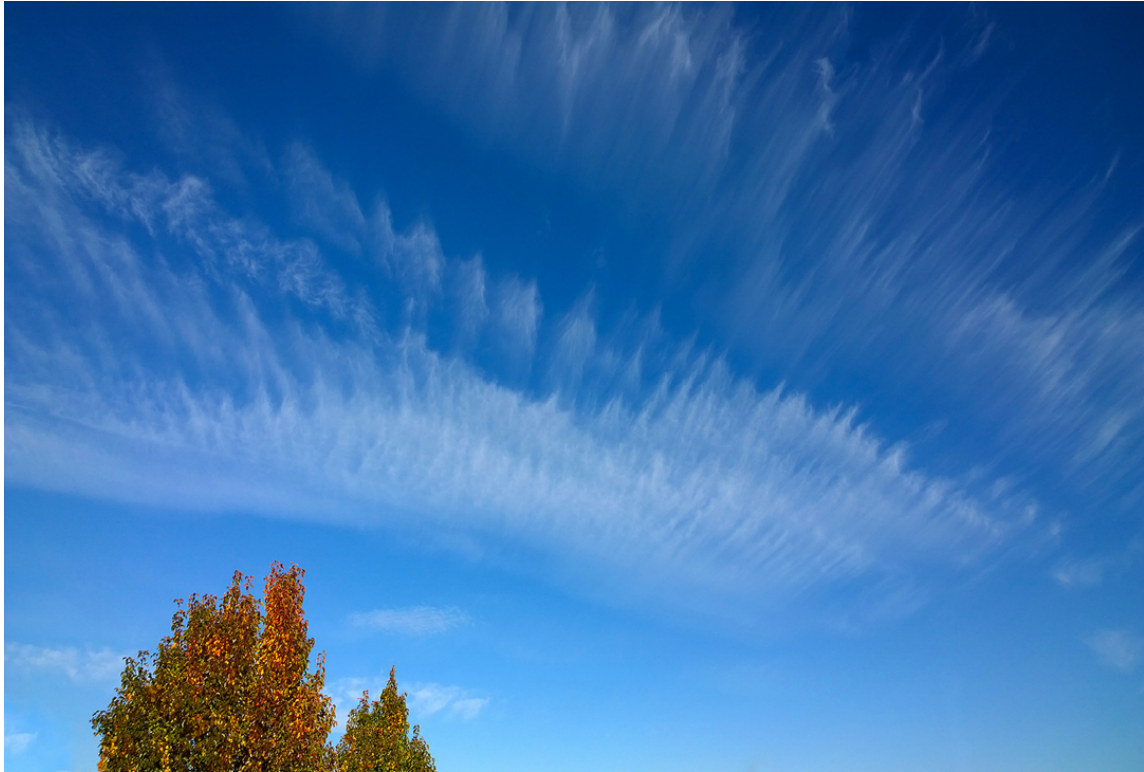
'Crown Cirrus' - Allan Flagel