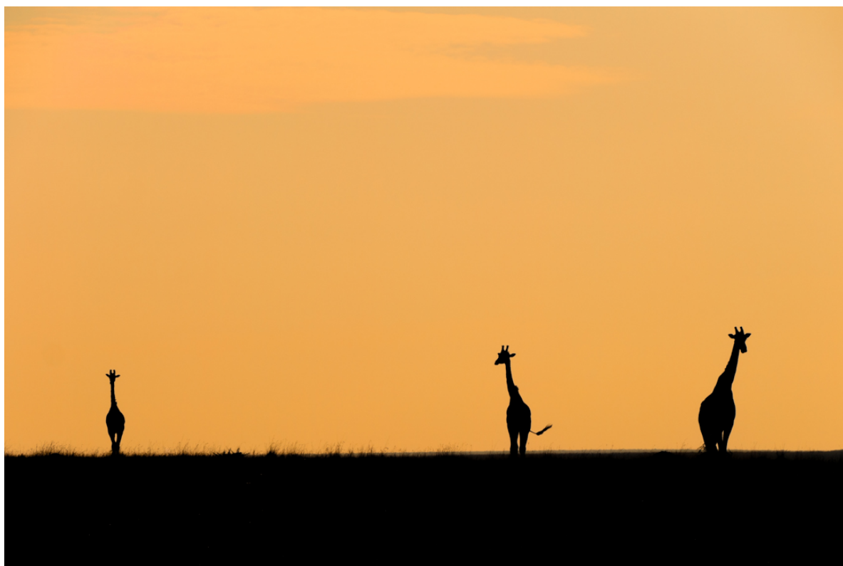
'Silhouettes at Sunset' - Leif Petersen