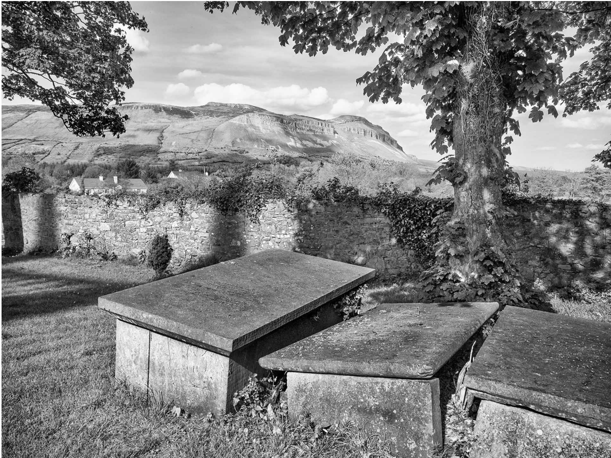
'Three Tombs - Drumcliffe Church, Sligo'