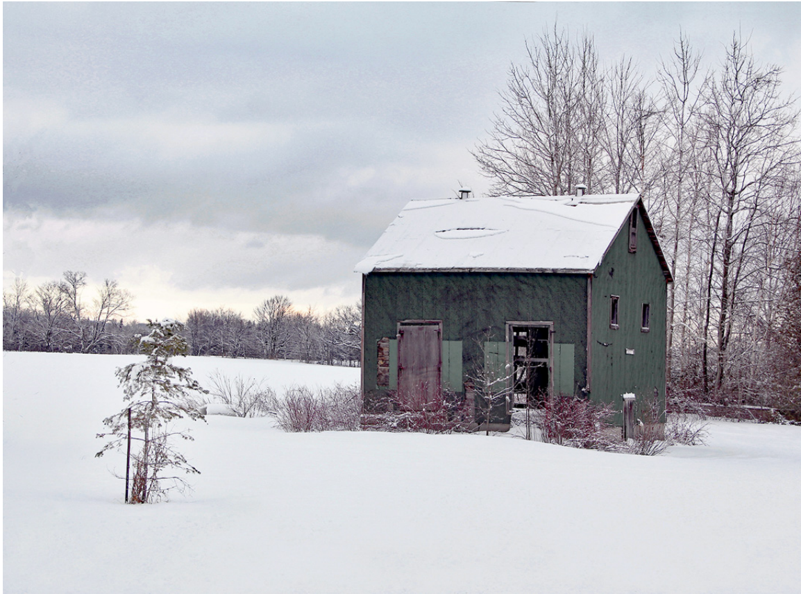
'Still Standing' - Laurence Sitwell