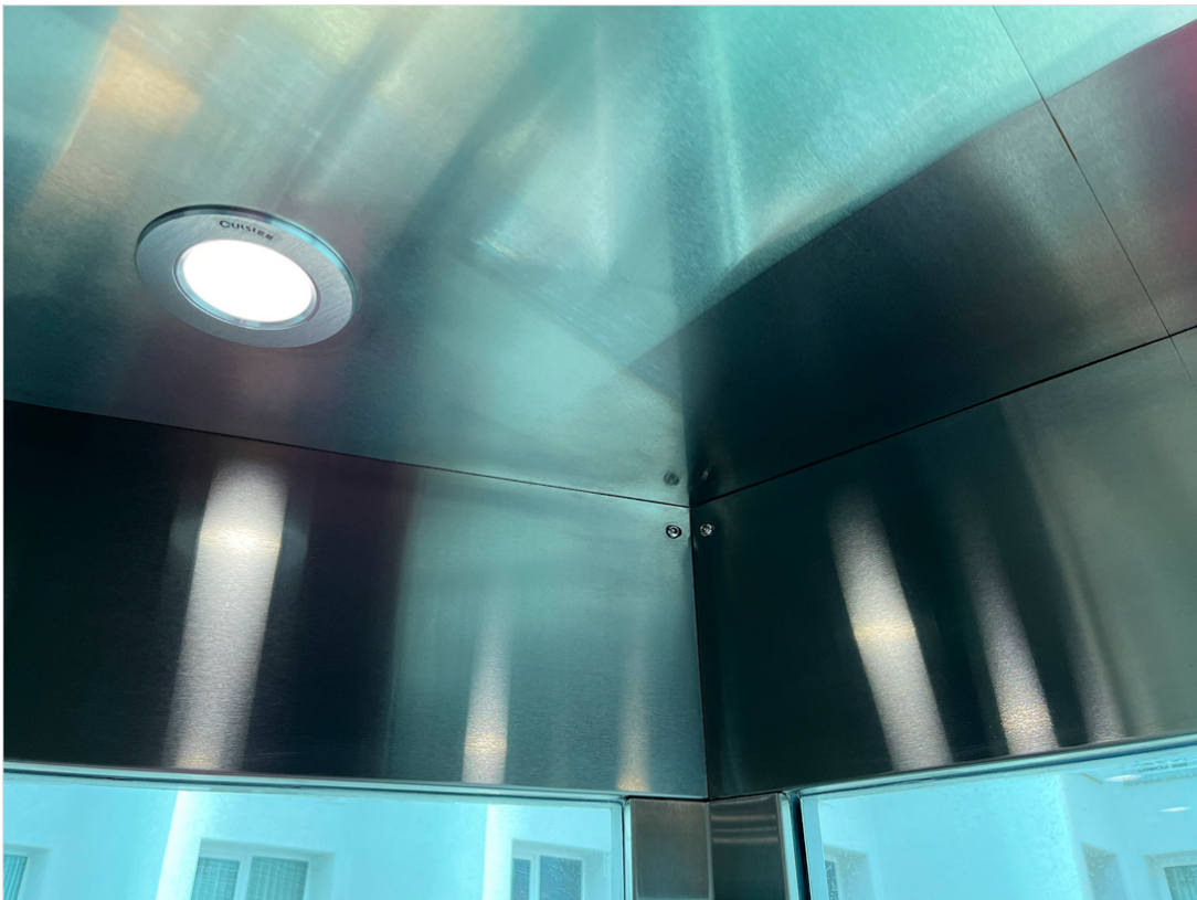
'12 - Ceiling Lights'