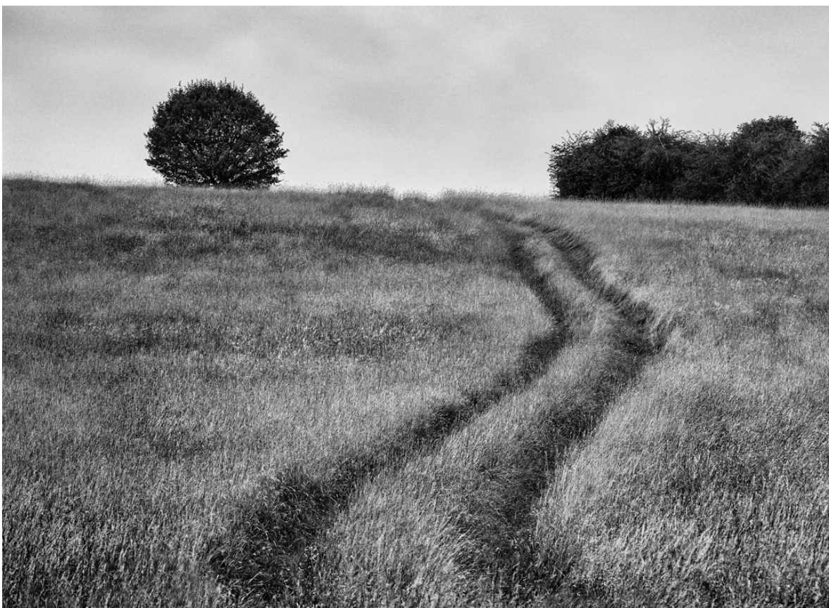
'Over the Top' - Steve Rees