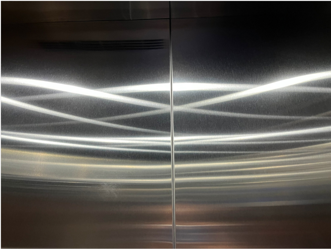
'6 - Door Waves'