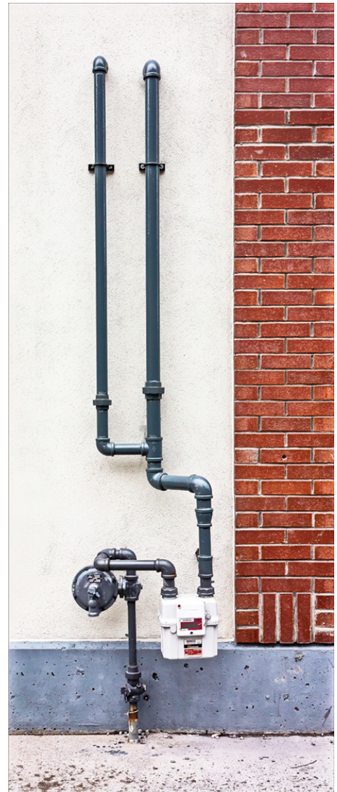
Extra Print: 'Industrial Art 2' - Dass