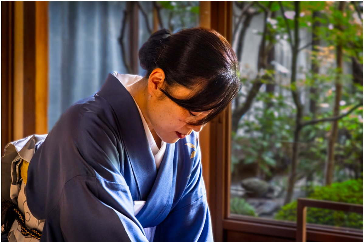
'The Essence of Tea - Harmony, Respect, Purity, Tranquility' - Dass