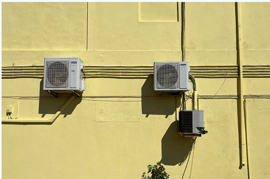
'Wall to Wall' - Allan Flagel