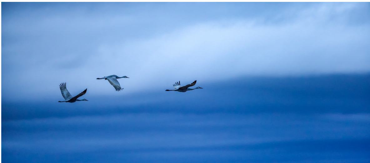
'Flying Into Their Future' - Nick Janushewski