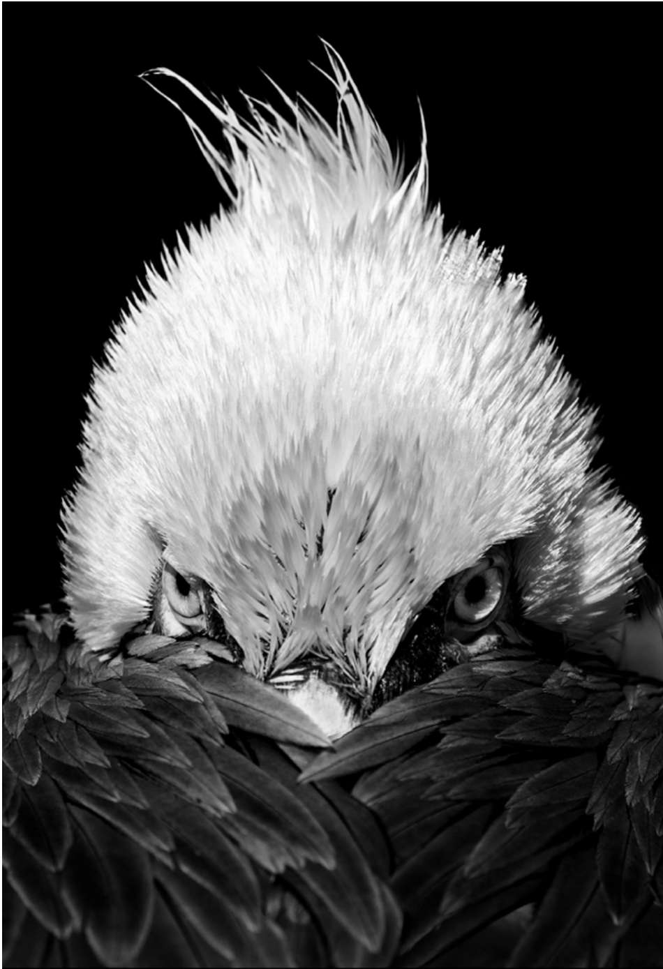
Pelican, by Dass

2022-2023 Issue 15 for meeting of April 19