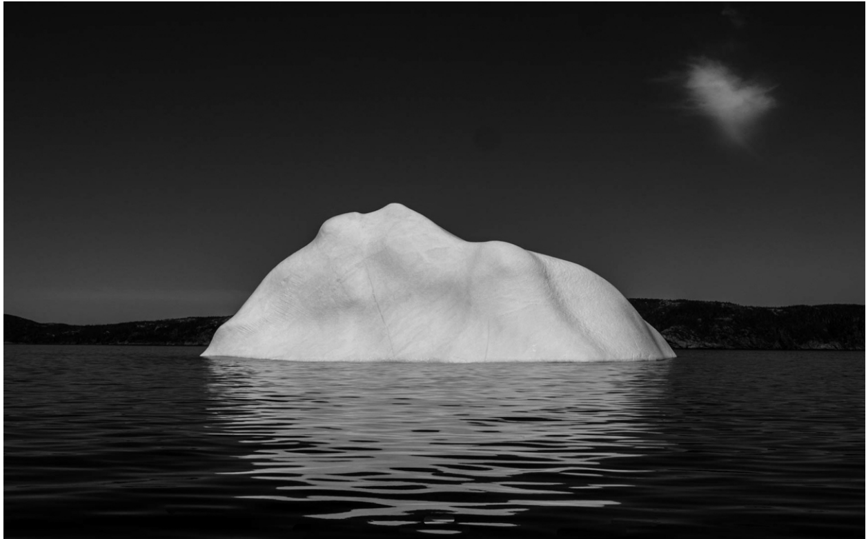
Floating, by Leif Petersen

2022-2023 Issue 15 for meeting of April 19