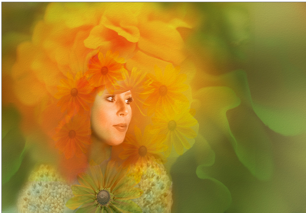
Above: No Title, by Laurence Sitwell