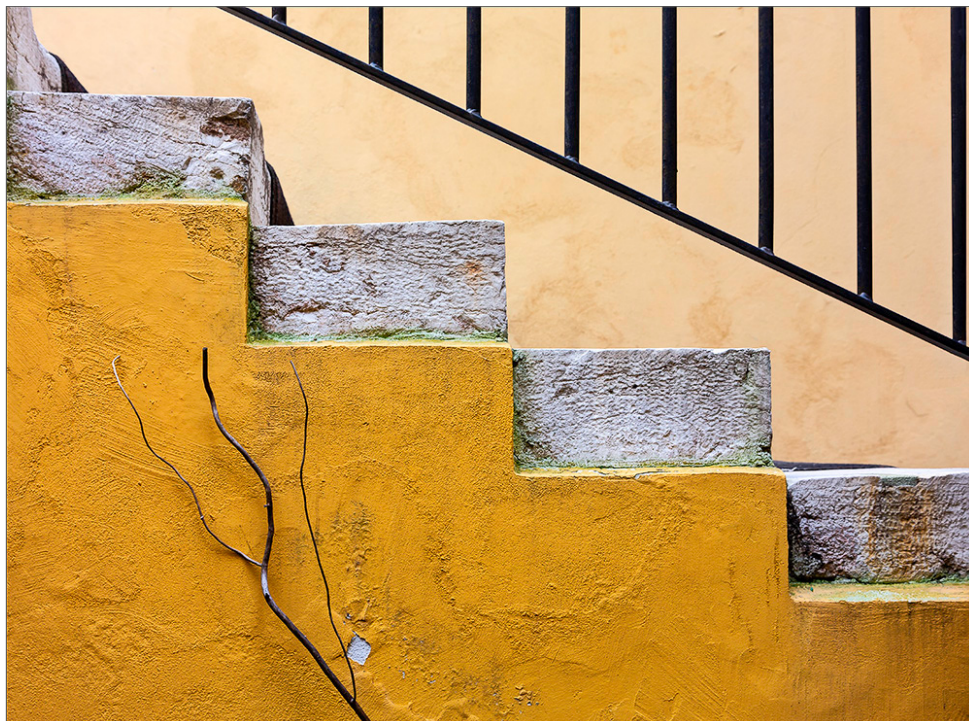
Wabi-Sabi, by Dass